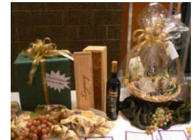
Sample of Past Silent Auction

2010 Best of Show Russell Creek Winery 2008 Sangiovese