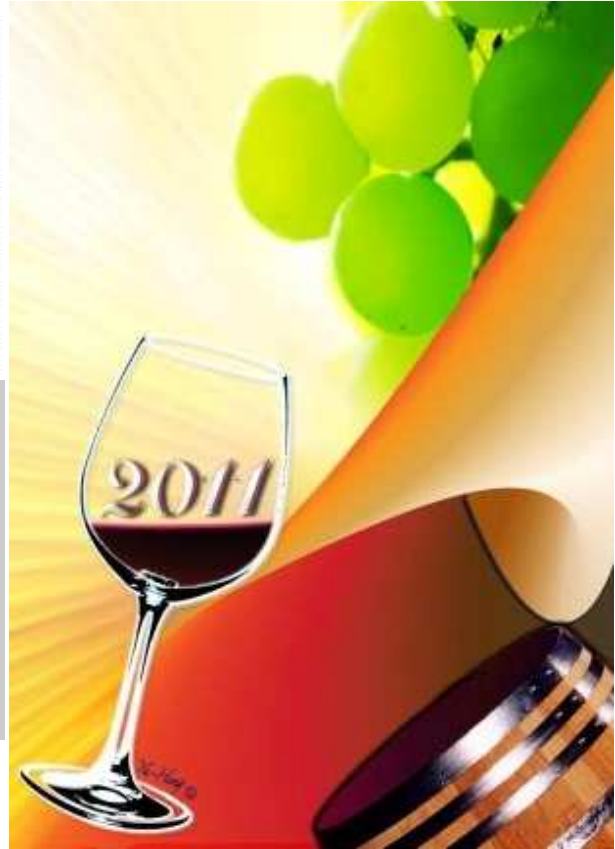
2011 Tri-Cities Wine Festival Artwork (Artist: Yu-Heng Dade)

Rate: $79.95 per night plus applicable taxes Ask for the "Tri-Cities Wine Festival Rate"